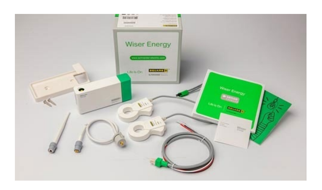
Exhibit 4: The Schneider Wiser Energy™ system