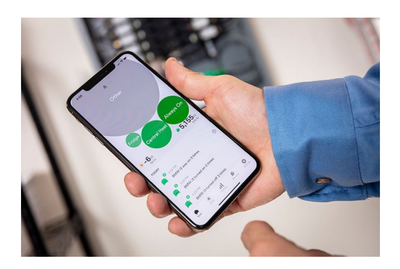
Exhibit 5: The Schneider Sense Application