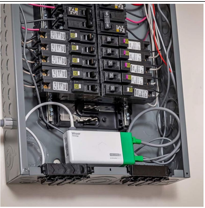
Exhibit 3: The Schneider Whole House Surge Protector