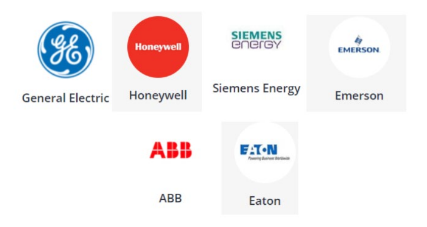
Exhibit 2: Key Competitors of Schneider Electric