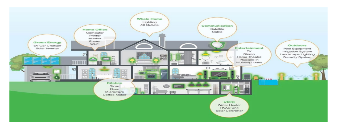
Exhibit 1: Typical Surge Protected Devices